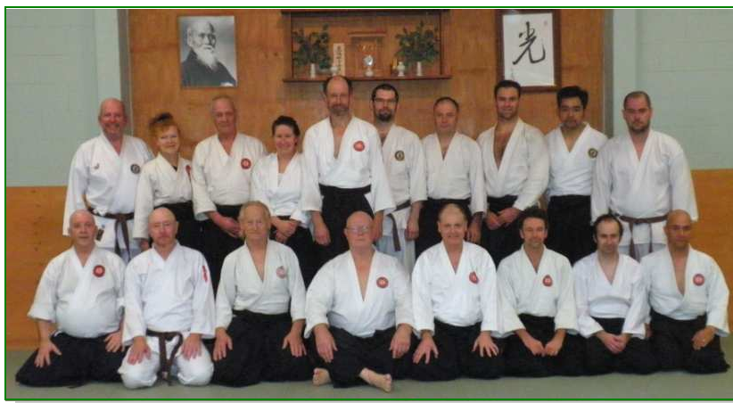
High Grade Retreat at The Learning Centre, Auckland